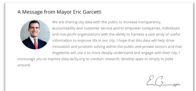
Example of Los Angeles data used by Captis

PENNSYLVANIA Right to Know Law – 65 Pennsylvania statute 67.101